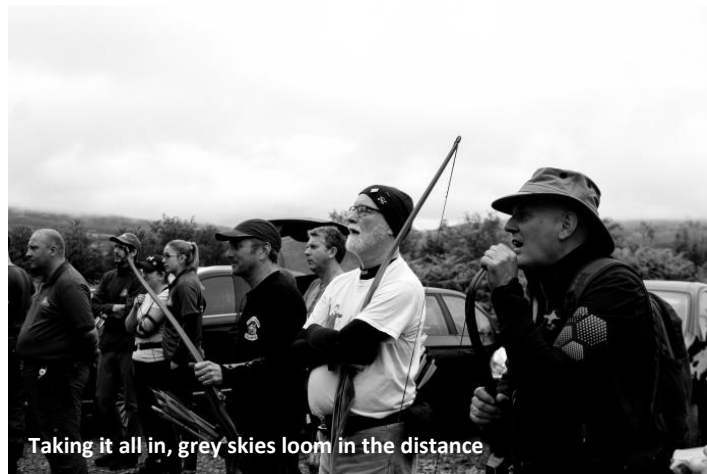
Taking it all in, grey skies loom in the distance

championship courses in play for the weekend. A 14 target Unmarked Animal Round (UAR), and an 18 target Standard Big Game (SBG), course. Both courses are shot twice by the participants over the course of the two days. The UAR course is laid out in mostly open terrain of freshly planted Sitka Spruce mixed with some mature beech and Silver Birch offers some great views, which unfortunately were not easily seen on the Saturday. The SBG course on the other hand is laid out in mature forestry which offered a totally different prospect for the competitors. Once all the start targets were called out, everyone headed out to their starting positions and we were off in earnest. Conditions became tricky to say the least for the Saturday crews. A steady mist shrouded the woods all through the day but noticeably more so in the afternoon. I felt that the Saturday SBG shooters got the luck of the draw, being in the better coverage of the mature forest. Yet targets on the SBG course took on an eerie feel in the haze. Unlimited compounder folk struggled with lenses to zone in on some of the more distant targets in the thick woodland. Over on the UAR course visibility was better but rain cover was not so abundant. With all the rain on Saturday only a few snaps were taken, here's a first set of some of the pics of the weekend.