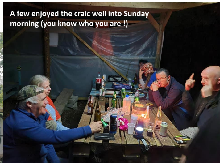
A few enjoyed the craic well into Sunday morning (you know who you are !)