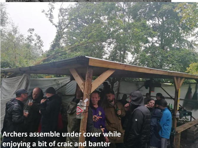
Archers assemble under cover while enjoying a bit of craic and banter