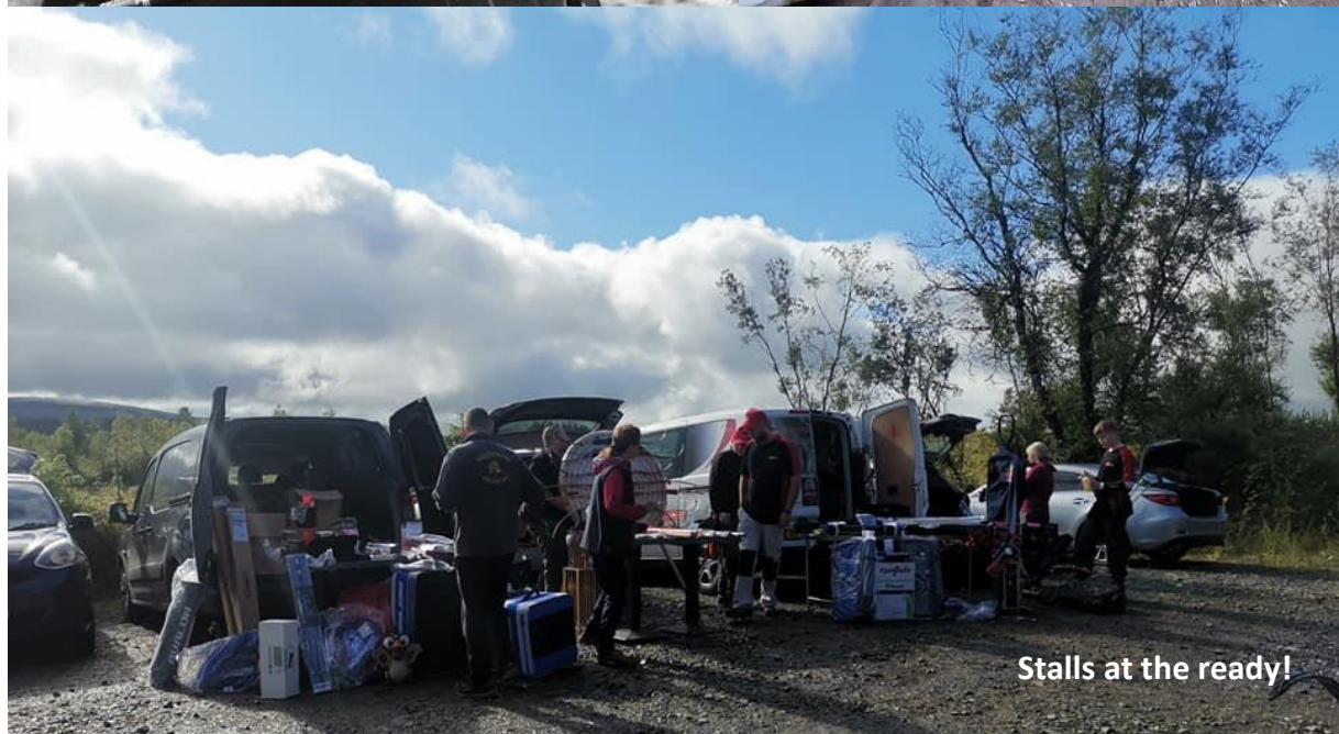
Stalls at the ready!