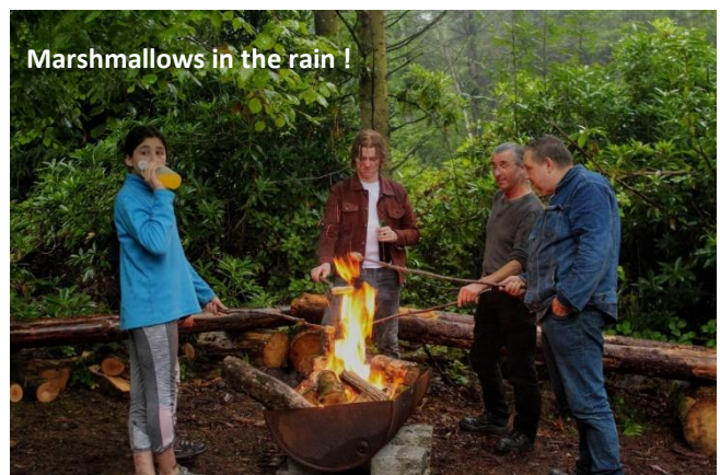
Marshmallows in the rain !