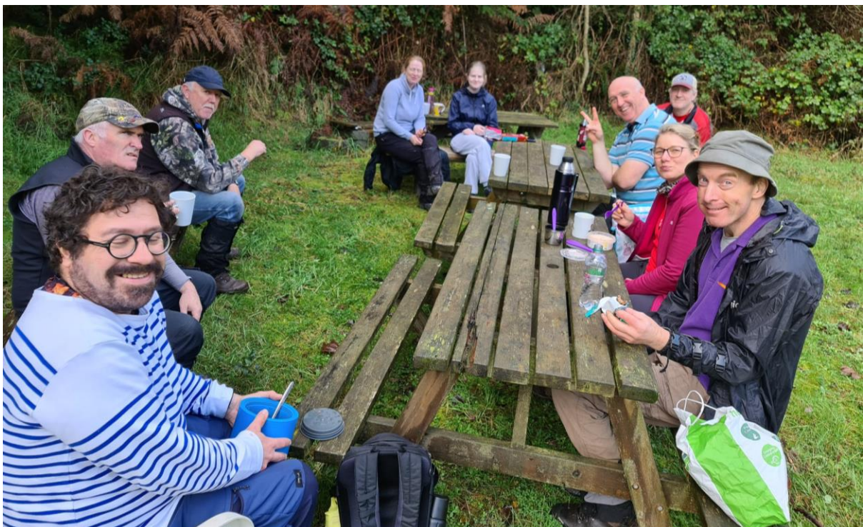
Figure 7 Happy campers at the half time break