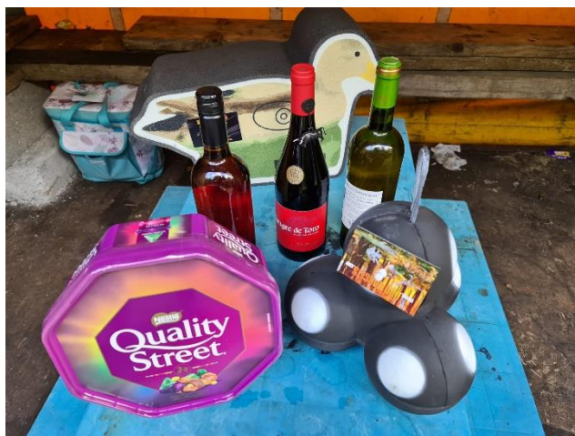
Figure 8 Raffle goodies